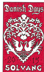
This Year's 2015 Pin

Support our Festival! Purchase Official Danish Days Souvenirs. All proceeds support Danish Days.